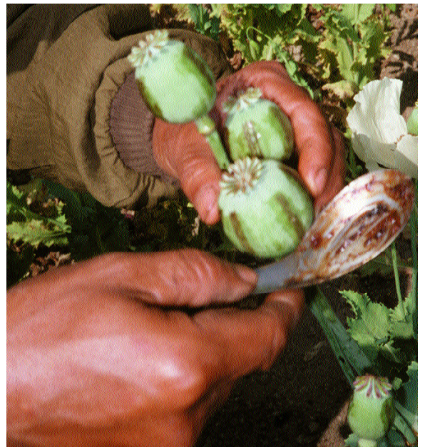
lllegal opium production.

prohibitions of the conventions. This decriminalisation trend has most commonly been associated with cannabis but in a number of countries it includes all drugs. It is a challenge to both the letter and spirit of prohibitionist legislation and will inevitably to lead to more reasoned consideration of supply-side reforms. Whilst wider moves towards legalisation are still some time away, the decriminalisation trend appears to point the way to a challenge from a coalition of progressive states to reformulate or withdraw from the UN conventions. The aim will be to allow locally determined regulatory systems and bilateral trade agreements to be established.